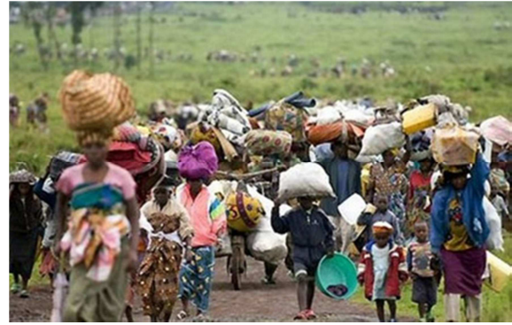
Figure 2. People moving out of the State on foot in search of safety, peace, food, etc.