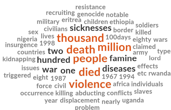
Figure 5. Notable Wars and Conflicts in Africa: Query Results on Word Frequency.

whisking people in demand for ransom to killing. The Southwest Region of Cameroon has been suffering from financial draining due to people moving to other State in search of peace. School children killed, government officials killed, hospitals burned, prisons invaded, and prisoners set free to join the Amazonians forces under duress. Wars and civil wars as shown below helped to cripple the country economically. Except the power that be in the Republic of Cameroon will put a stop to the crises on the anglophone regions or the Amazonian crises the country will suffer from economic hardship as unemployment rate has skyrocketed. As of 2017, Caparos et al. [1] noted that the number of wars and ongoing political and religious conflicts is dramatically high around the world. There are high tensions in Cameroon, Burundi, Nigeria, Mali, Central African Republic, The Democratic Republic of Congo, Iraq, Libya, Mali, Nigeria, etc.