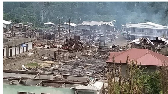
Figure 4. Properties destroyed and burned due to the crisis.

According to the International Monetary Fund [5], Adrain posed that a prolonged period of dislocation in financial markets could trigger distress among financial institutions, which, in turn, could lead to a credit crunch for non-financial borrowers, further exacerbating the economic downturn. U.S. Ambassador to Cameroon has criticized Cameroon's actions and expressed his concerns about the government's use of disproportionate force. The increased tempo of government repression is fueling secessionist sentiment leading to instability in the country (United States. Congress et al., [12]. There has been too much blood shared stemming from the frustration of Anglophones teachers and lawyers to the closing down of schools and torturing of citizens from the English-speaking Regions (Southwest and Northwest). Here has been kidnapping to