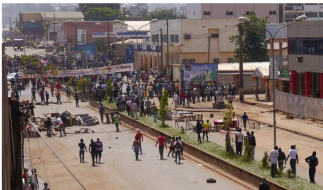
Figure 1. Cameroon's Anglophone Crisis at the Crossroads.