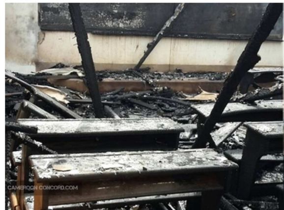
Figure 3. Kids and students out of school for years as classrooms are destroyed and burned.