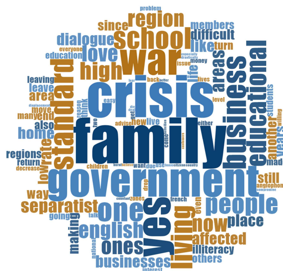
Figure 6. Query Results on Project Properties: Word Frequency.

A survey was conducted with a sample population 100 participants but 30 responded. The participants were made up of male and female with the age group of 18-65 years old. The participants were people from Africa, less develop or under develop countries who had in some way experienced war, especially the people of the Southwest Region of Cameroon.